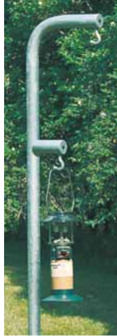
(Above) Model LH/G-1A Lantern Holder with galvanized finish and welded-on Wheelchair Accessible Hook. (Left) Model LH/G-1 Lantern Holder with galvanized finish.